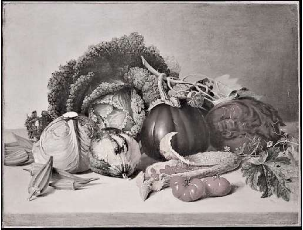
Still Life: Balsam Apple and Vegetables, 1820s, James Peale

"I will sing to the Lord, because he has dealt bountifully with me." Ps 13:6