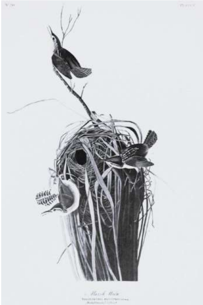
Marsh Wren , John James Audubon 1785-1851

"Look at the birds of the air: they neither sow nor reap nor gather into barns, and yet your heavenly Father feeds them." Matthew 6:26