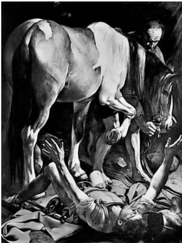
Conversion on the Way to Damascus, Caravaggio, 1601

But Saul, still breathing threats and murder against the disciples of the Lord, went to the high priest and asked him for letters to the synagogues at Damascus, so that if he found any belonging to the Way, men or women, he might bring them bound to Jerusalem. Now as he went on his way, he approached Damascus, and suddenly a light from heaven shone around him. And falling to the ground, he heard a voice saying to him, "Saul, Saul, why are you persecuting me?"